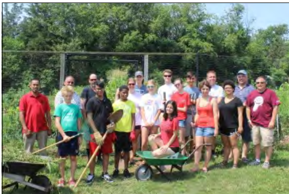
The Group at Community Garden Holy Trinity - Somerset NJ