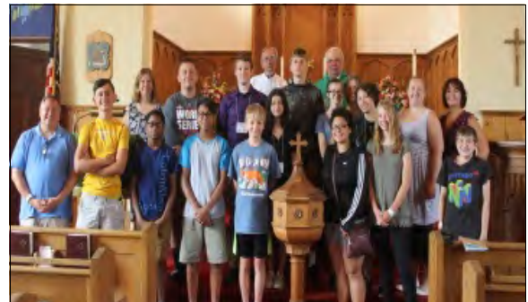
The Group at St. John - Bound Brook NJ