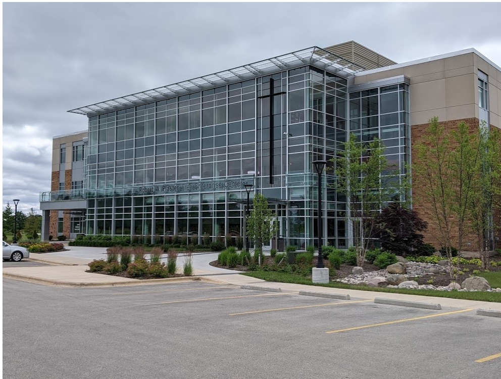
The campus of Concordia University in Mequon, Wisconsin is situated on Lake Michigan