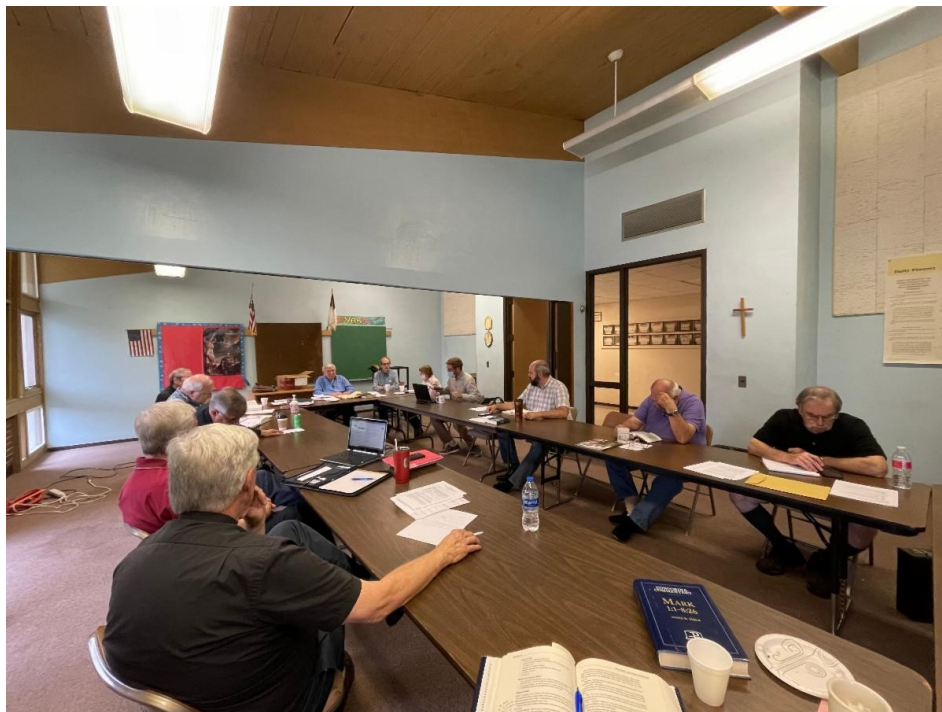
The Central Circuit meeting on September 15, 2021