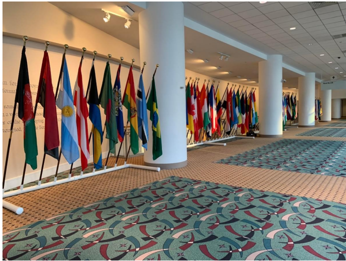
Left photo: The Flags of Countries receiving mite grants.