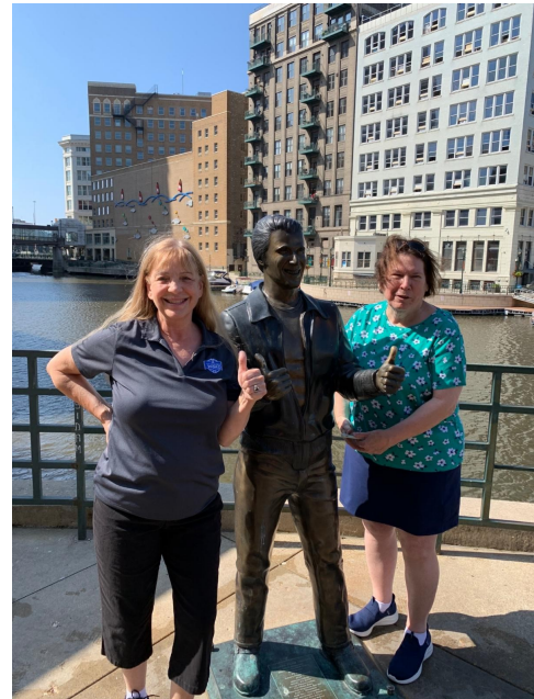
Right photo: No visit to Milwaukee is complete without seeing the Fonz.