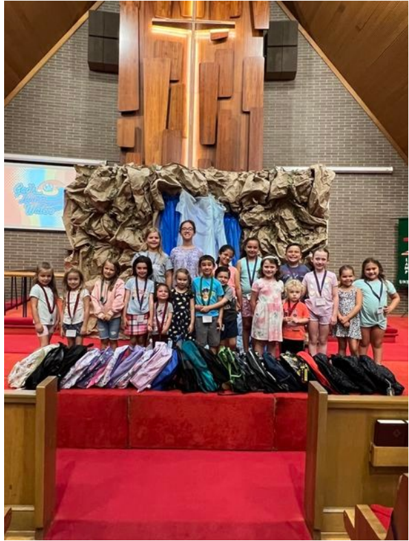
Photos above: Left - Collection for the Food Bank Right: Backpack collection