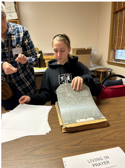
Pictured below are members working on the Braille Bonanza