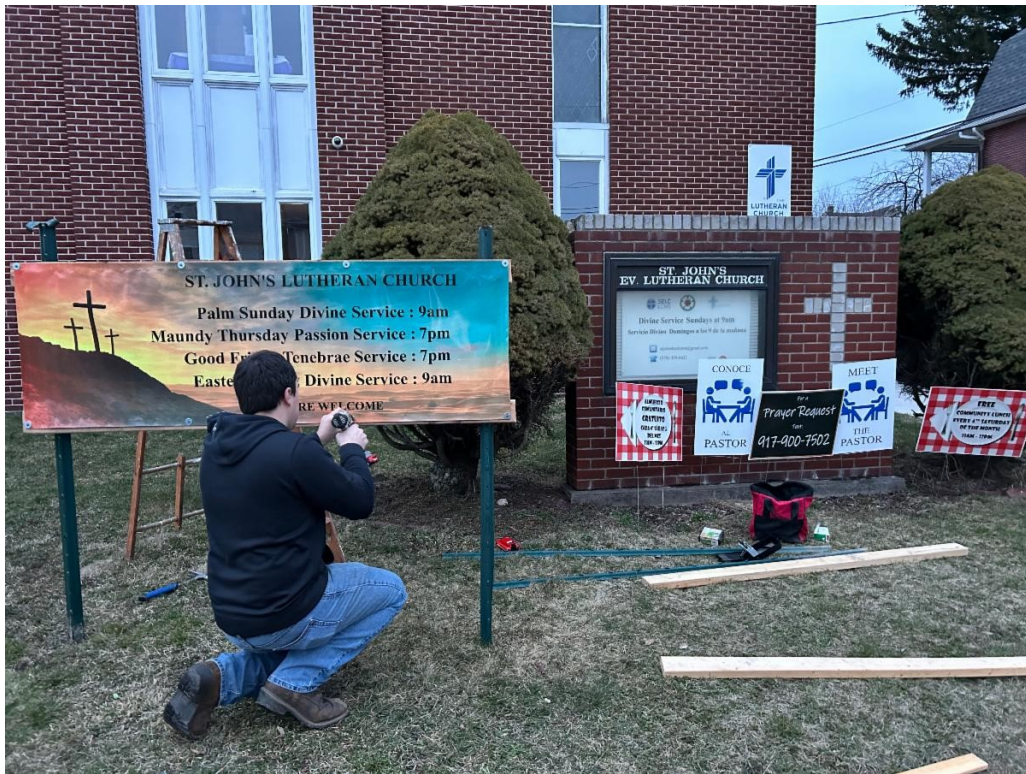
Pictured above is a member putting up the bilingual signage for Holy Week services