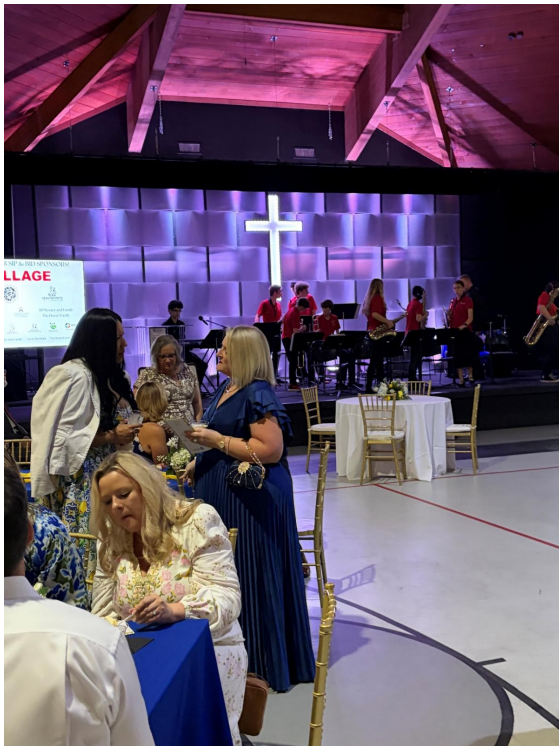
Pictured below is the HCLA Band