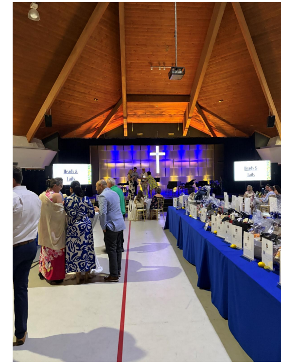
Pictured below are the Silent Auction table and the stage.